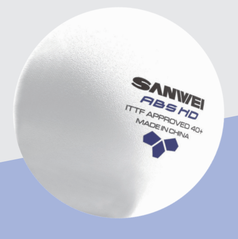
TABLE TENNIS ENGLAND OFFICIAL COMPETITIONS BALL 2022-23