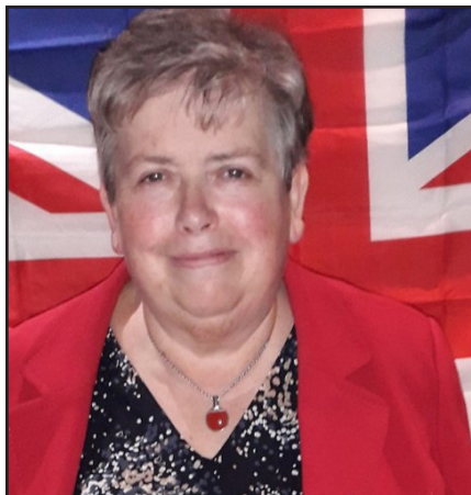
Table Tennis England Vice President 1999; Honorary Life Member 2014; Ivor Montagu Award 1997.

Chairman, Halton Table Tennis League 1997-2024 and Halton TTC 1999-2024 (founder member).