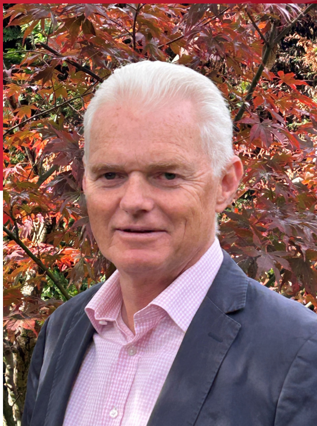
Table tennis is going from strength to strength with more than 450,000 people playing regularly; this happens because of extraordinary people in our team and across the wider table tennis community.

Our strategy, Table Tennis United , sets out an exciting journey of growth and transformation that underpins our purpose to 'host generations of players at our table', and towards our vision of 'a table tennis nation'. We have recently been awarded the hosting of the World Team Table Tennis Championships in London in 2026.