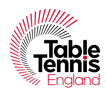
Table Tennis England Euro Mini Championships 2025 v1.0