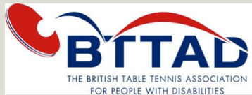
British Table Tennis Association