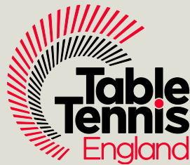
Table Tennis England