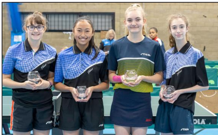
Team of the weekend