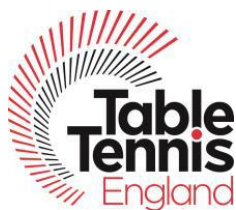
TABLE TENNIS ENGLAND