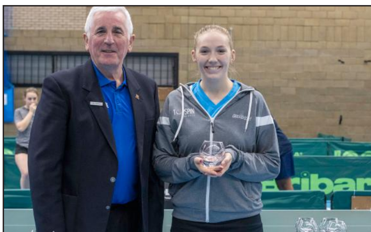
Player of the weekend