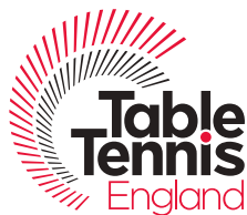
TABLE TENNIS ENGLAND'S OFFICIAL BALL 2018/19 & 2019/20